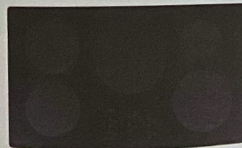
GE 5-BURNER BUILT-IN INDUCTION COOKTOP $2,599, GEAPPLIANCES.CA.

"You can't beat induction cooking. The safety aspect alone is a deciding factor for many of our clients, especially those who want the flexibility of placing their cooktop on the island. Kids can eat right in front of the cooktop with no fear of injury."