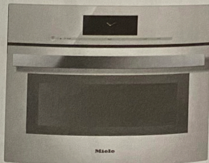
MIELE 24-IN. DGC 6800 PURELINE M TOUCH COMBINATION STEAM-CONVECTION OVEN FROM $6,599, MIELE.CA.

"We love the white finish of this Miele oven, which allows us to integrate the wall oven into white cabinetry seamlessly. The 24-inch width can be easily designed into pantry walls, and the features include a steam-convection oven."